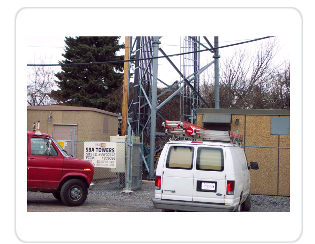
Telecommunications & High Voltage

Tel: 716.831.2236 Fax: 716.862.9400 Web: www.acen.com