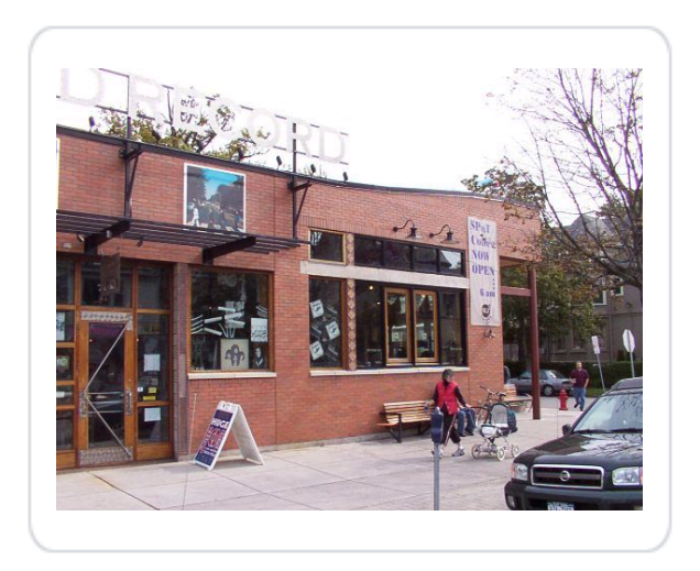
Retail & Commercial