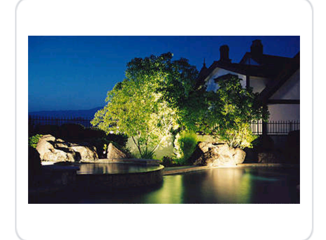
All-Weather & Underwater